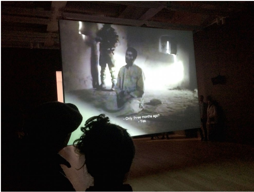
The b-side of O'Say Can you See .

sion of the clips she used to open the film. The soundtrack to both is a stretched rendition of the national anthem, performed at Yankee Stadium during Game Four of the 2001 World Series. The specific notes of the anthem are undecipherable but provide a sufficiently haunting soundscape that pairs well with the slow motion frames of the Ground Zero visitors, if not the interrogation. The stretched time-scape serves to illustrate the temporal schizophrenia that many of us felt on September 11—the feeling that the world had at stopped spinning and yet was hurtling toward oblivion at the same time. As a curatorial gesture, it also serves to smother the interrogations with the deadly spectrality of the American State.