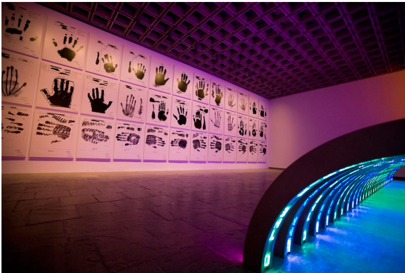
Jenny Holzer’s Redaction Paintings from her Protect Protect exhibition at the Whitney Museum, 2009.