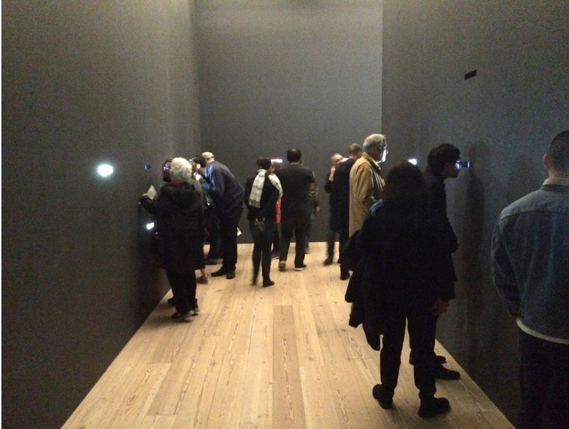
Cubby-hole slots containing the documents and videos from Disposition Matrix .

of the U.S. Government.” It’s hard to know what the curatorial direction was in gathering these documents, perhaps twenty in total. The most direct connection between them is that they all pertain, in some way, to the so-called War on Terror, or more broadly, to the post-9/11 security state. Behind one cubby is a drawing of a waterboarding platform. Behind another, drone footage. And behind yet another, a letter from the former CIA director George Tenet, concerning NSA guidelines for collecting information on foreign computers.