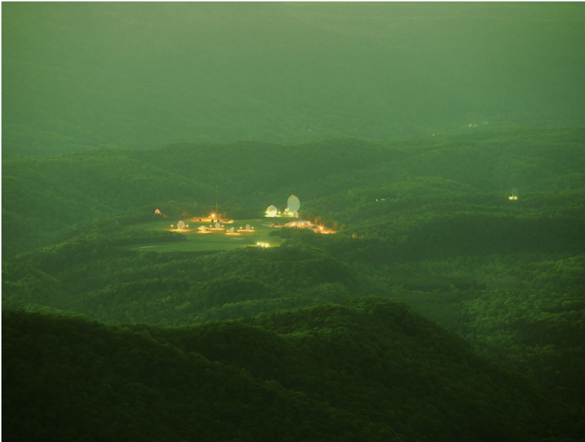
Trevor Paglen, They Watch the Moon , c-print, 2010. A photograph of a classified “listening station” deep in the forests of West Virginia.

Paglen's work spans many such engagements with statecraft, whether mapping CIA rendition flights or using high-powered telescopic lenses to photograph government facilities like desert airstrips or remote surveillance stations deep in the mountains of West Virginia. The results are often sweeping references to the rich history of American landscape documentation and the peculiar expansive remoteness—the “covert sublime,” to use Lee's phrase—of various government facilities. The subject in much of Paglen's work is not the secret prison or the telecommunications satellite but the act of surveillance. On display is the lengths he will go to show what amounts to satellite dishes, small buildings, or streaks in the sky, which is to say, to show nearly nothing at all—small flecks of light and industrial buildings that have created a totalizing surveillance environment capturing the entire world.