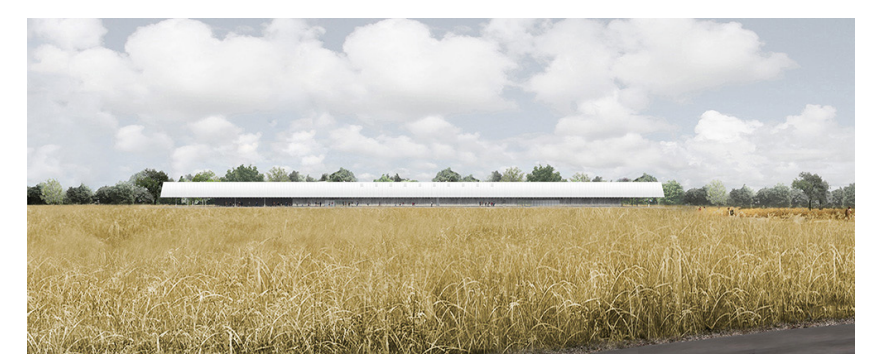
Herzog & de Meuron, Parrish Art Museum, Water Mill, New York, 2008–12. © Herzog & de Meuron.

architecture had. The flat line of the art cabin, dominating the site, replaced the collection of multiple versions of small barns. This flat line could be read as a sign of architecture's abrupt shift—from the pre-2008 bubble economy, which had allowed for multiplicity and archipelagos of distinct spaces, to the post-2008 condition, in which all spaces were consolidated into one barn, the cabin.