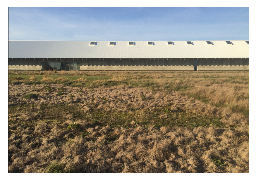
Herzog & de Meuron, Parrish Art Museum, Water Mill, New York, 2008–12.

The estimated cost of the new design was a third of the original proposal's. This was due in part to the architects' decision to engage local builders very early on in the design process. With the new concept sketch in hand, they visited one local builder whose specialty was constructing high-end mansions on Long Island using sophisticated concrete. During a tour of some of his completed projects, the architects noticed a certain kind of rough concrete used in the basement of a clubhouse that the builder erected for the local golf club. This, responded the contractor, was the most economical and fastest-setting concrete his team could pour. This kind of concrete became the major exterior material of the Parrish Art Museum.