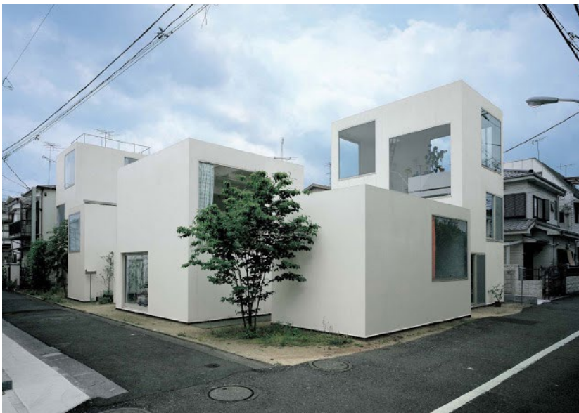
Moriyama House, Office of Ryue Nishizawa, Tokyo, 2005.

[4] “A New Innocence: Emerging Trends in Japanese Architecture” was a lecture series held at the Harvard Graduate School of Design in 2011 that included the talks by Fujimoto and Nishizawa, as well as Kazuyo Sejima, Junya Ishigami, and Toyo Ito.