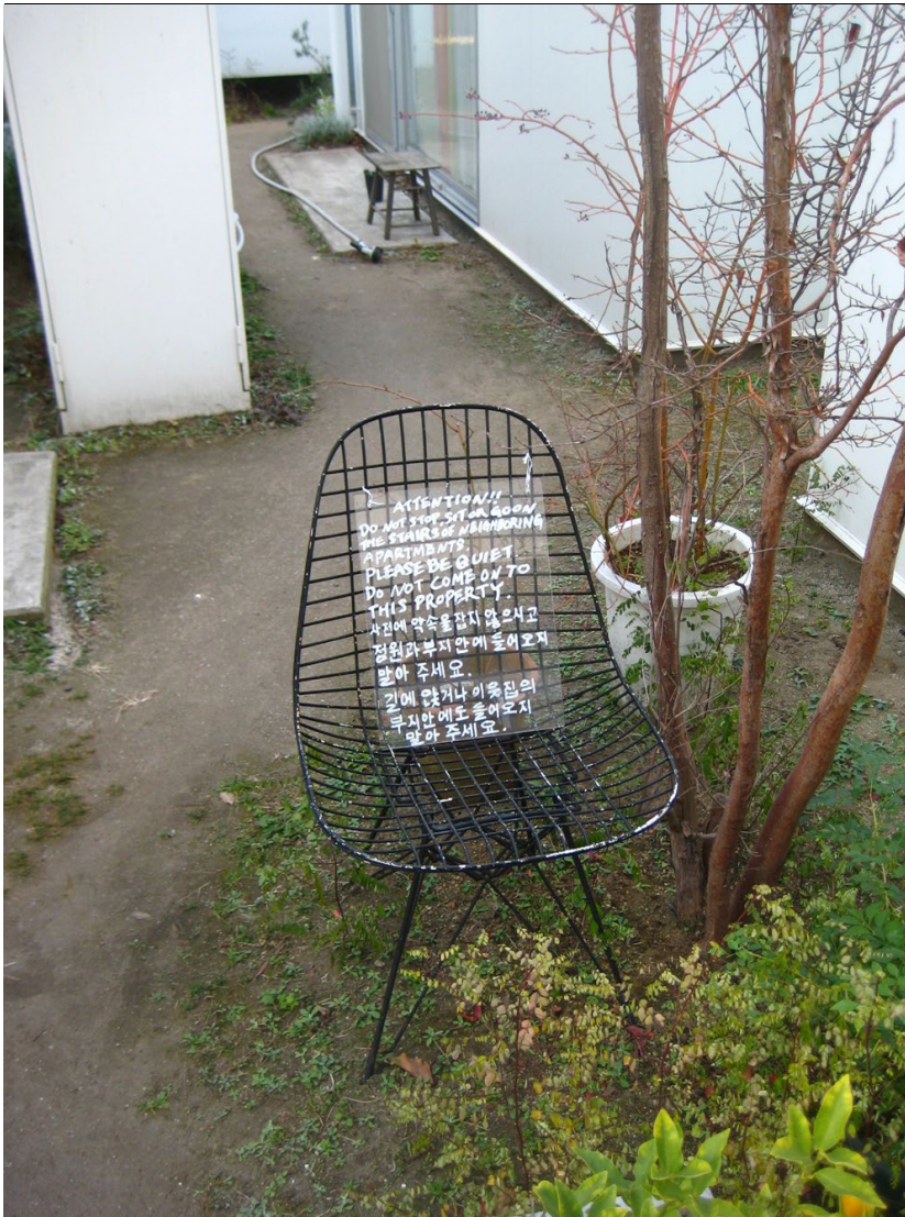
Moriyama House sign, 2011.

my Tokyo colleagues, the novelty of living at Moriyama mostly attracts young architects who move in and out in relatively quick succession. Its comfort issues are no secret—we learn from Maak that Mr. Moriyama himself migrates between upper and lower stories of his own three-story capsule depending on the weather—and I suspect that the smallness of its private indoor spaces also contributes to the rate of turnover. [17] In comparison, we can turn to the most standard apartment in all of postwar Japan, the so-called 2DK. Usually measuring around 400 square feet, the design is comparable in size to apartments presented today in New York City as “micro-units,” but it was meant to house a family. A survey conducted in 1970 by the Japan Housing Corporation (the public-private national entity that built close to a million apartments between 1945 and 1973) found that 76 percent of its 2DK residents rejected the dwellings, mostly for being too cramped, especially when their households included children. [18] Many of Moriyama’s units are considerably smaller at less than 200 square feet. While Maak elsewhere in the book criticizes the Torre David squatter housing in Caracas as “misery as picturesque,” this description might also apply to Nishizawa’s project. [19] In Japan small may be normal, but that doesn’t mean it’s desirable.