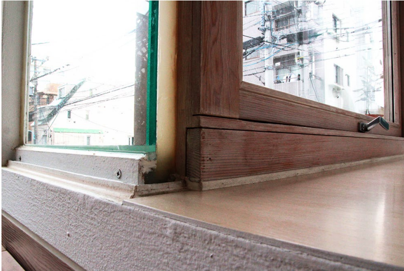
House NA single-pane glass detail.

[14] Living Complex , 87. Maak refers to the use of EIFS.