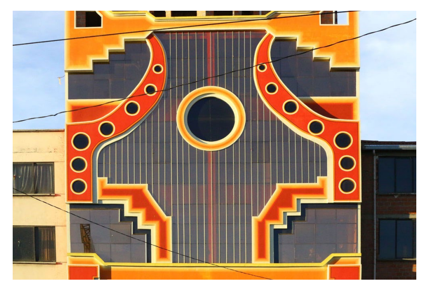
Cholet façades sometimes draw inspiration from colorful Andean textiles.