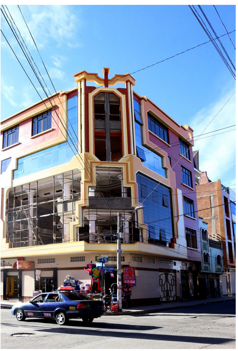
Construction of a {\it cholet} in progress.