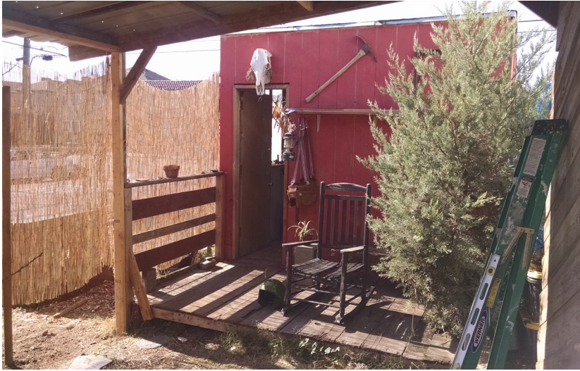
Blighted properties in Oakland reflect the region's uneven development, 2015.

stages, so inexpensive and modular designs that can be easily and cheaply constructed using commonly salvaged or off-the-shelf materials and hand tools are ideal. DeCaprio also espouses the ideals of sweat equity: once a squat has been secured, Land Action initiates a number of home improvements to its squatted properties, including installing drywall and new floors. In one squat in particular where DeCaprio resides, DeCaprio installed solar panels on his roof and remains off-the-grid.