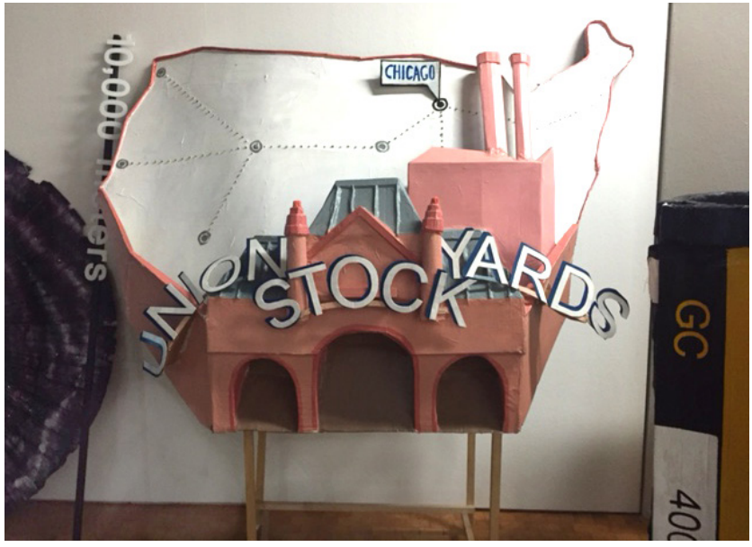
Props from the Superpowers of Ten performance, Andrés Jaque and the Office for Political Innovation, 2013–16.

norms of representation—from the gaze of the viewer to the fixity of a finished work—the representational apparatus they are inserted into, which is to say the art museum with all its conventions, including linear, often teleological, spatial arrangement and circulation remains less challenged. There are, however, some beautiful slippages in our field guide's ordered path. From the bird's-eye view of the Powers sketches we are taken to the view from within the laboratory (another of Latour's favored haunts) for Wall of Science , an installation of stacked television monitors playing short documentaries from the Harvard Cyclotron and Straus Center for Conservation Studies. They run from seven to fourteen minutes: narrations of canvas restoration; a fish swimming in a tank; and Tom and Jen, a couple explaining how their domestic life enters the lab where Tom works. It's in the adjacency (not juxtaposition) of pieces like this with installations like Jaque's, the commanding photography of Armin Linke located across the room, and the delicate tensions of Sarah Sze's sculpture