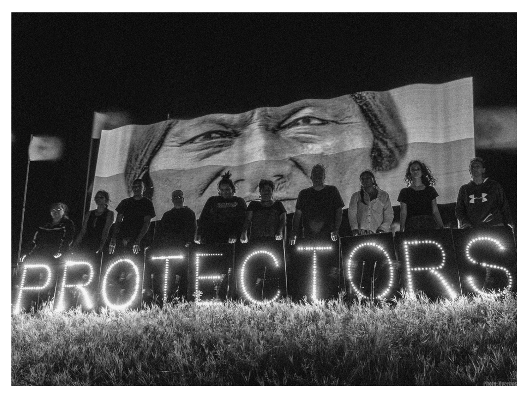
Sitting Bull with protectors in Canon Ball, ND.