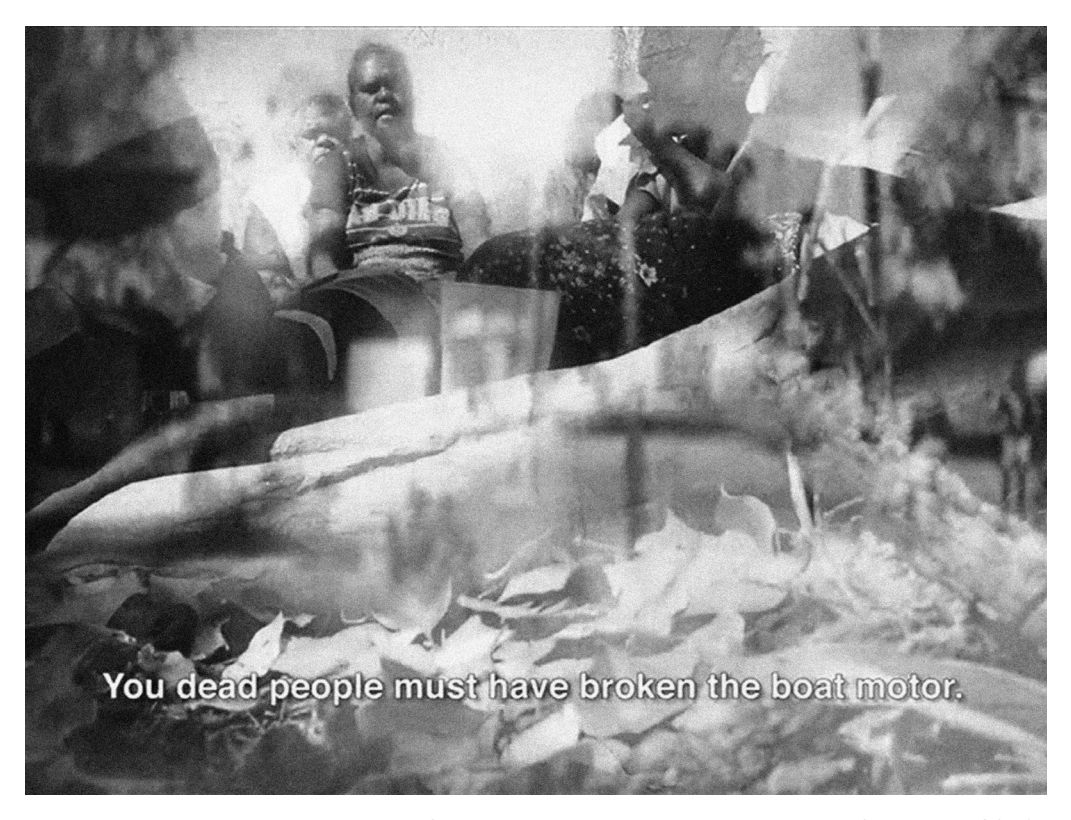
Film stills from Wutharr: Saltwater Dreams by the Karrabing Film Collective, 2016.