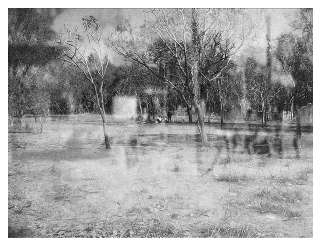
Film stills from Wutharr: Saltwater Dreams by the Karrabing Film Collective, 2016.