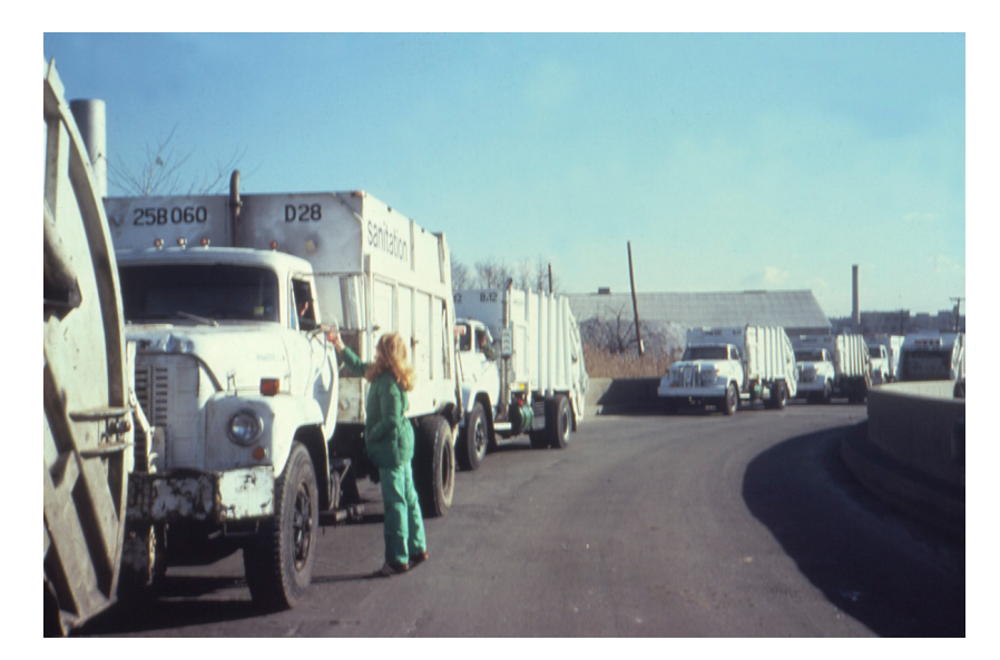
Mierle Laderman Ukeles, Touch Sanitation Performance, 1979-80; "Handshake Ritual" with workers of New York City Department of Sanitation.