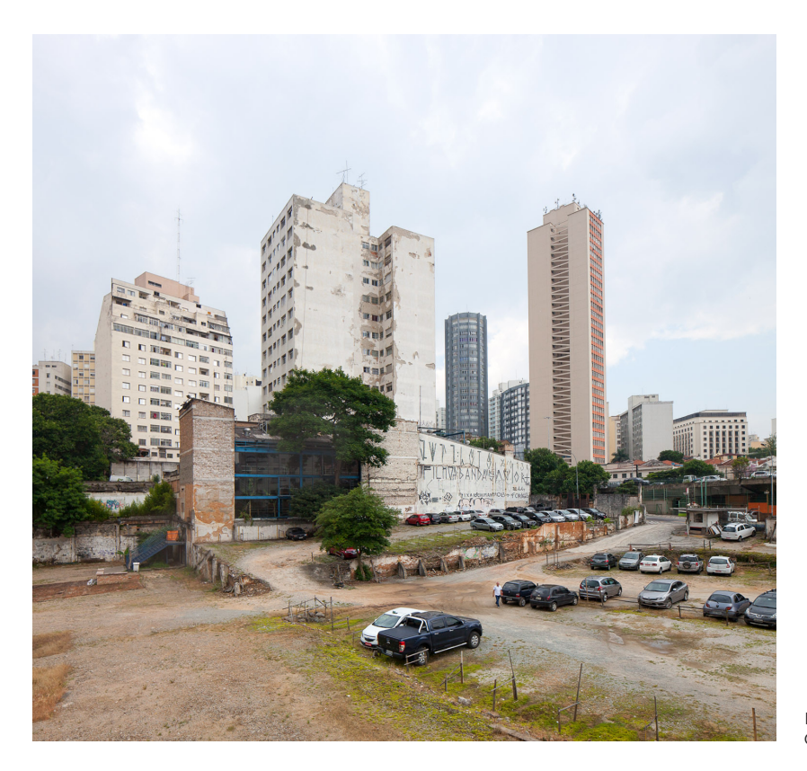
Lina Bo Bardi's Teatro Oficina in Sao Paulo.

served as an arena of political resistance against the military dictatorship that ensnared Brazil from the 1960s to the 1980s and blossomed anew as an aesthetic powerhouse when the country restored its bumpy democracy nearly four decades ago. This war or resistance of sorts, first against an authoritarian regime and then against the much more pernicious attacks of the real estate market in downtown Sao Paulo, was long framed by and played out through strong rhetoric and architectural blueprints on either side. Everything, until now, was hypothetical. But those bulldozers materializing on the landscape were the first undeniable signs that this war had turned very real.