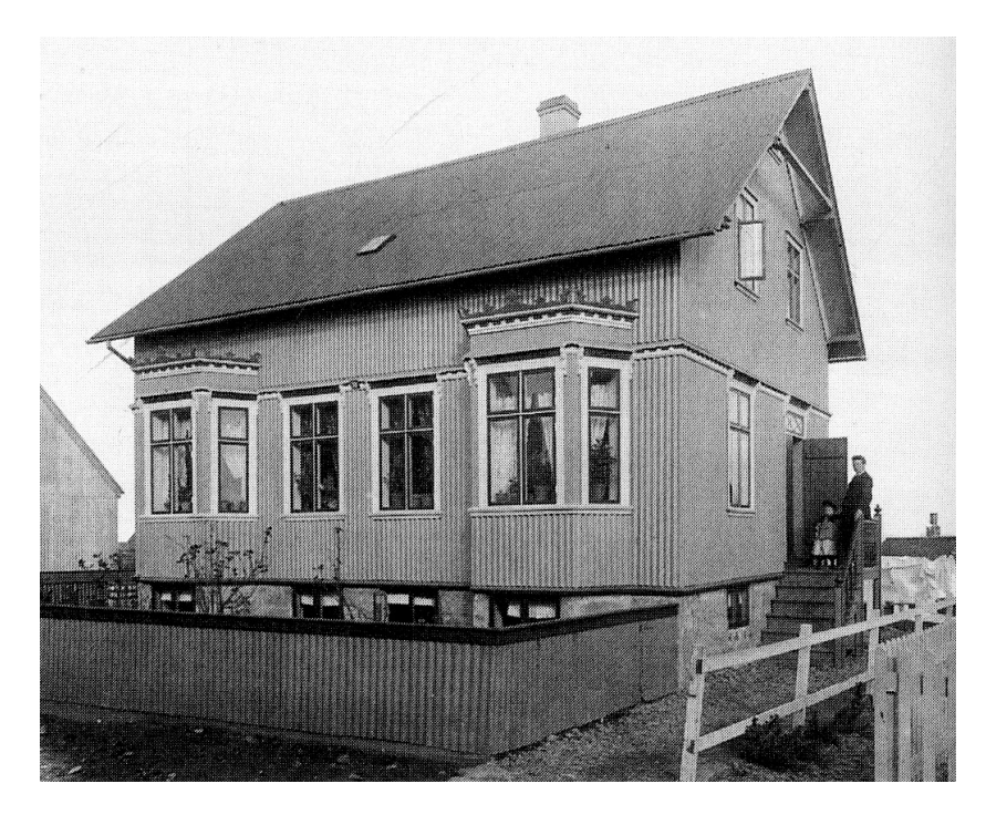
Vesturgata 18, Reykjavík, since moved to Bóklöðustígur 10. This is a very early version of a Corrugated Iron Sweiser, an Icelandic adaptation of the Norwegian Sweiser. Originally published in Hörður Ágústsson, Íslensk Byggingarafleifð I: Ágrip Af Húsagerðarsögu 1750–1940 [Reykjavík: Húsafriðunarnefnd ríkisins, 1998], 112.

idea of using corrugated iron as a replacement for maintenance-hungry wood paneling in the first place. Third, "corrugated iron" in Icelandic literally translates as "wave iron," creating an explicit relationship between these buildings and the sea they hold on to so tightly for their livelihood. The name of the Wave in Icelandic, "Báran," therefore explicitly references the cladding material as well as the sea, completing the metaphor and tying together the three scales; village domesticity, national industry, and the ocean on which each feed. The contextualism does not stop at metaphor and materiality—The Wave is one of the few cases in which the architects thought about opening the building up to village life, through ground-level openings exposing the interior activities to the