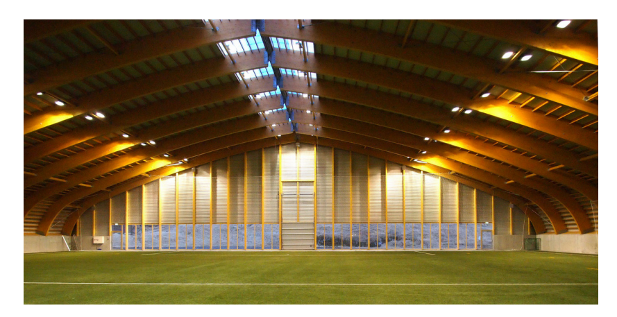
The Wave, Höfn, designed by Gláma/Kím Arkitektar, 2012. © Gláma/Kím Arkitektar.

In a clever contextualist move, the building is clad with Aluzinc corrugated steel sheets, simultaneously conjuring up three national imaginaries on different scales. First, corrugated iron invokes the Icelandic timber-framed houses, the oldest continuously inhabited houses on the island, which define the appearance of village centers. These houses were initially clad in painted wood paneling, later replaced with corrugated iron. Immediately recognizable by their gabled roofs, they have since become the most romanticized Icelandic house typology, evoking a touchy-feely imagery of the "human scale" despite themselves. Second, corrugated iron recalls the industrial counterpart to the timber-framed houses: the shacks in which twentieth-century Icelandic homeowners worked, and from which they probably derived the economizing