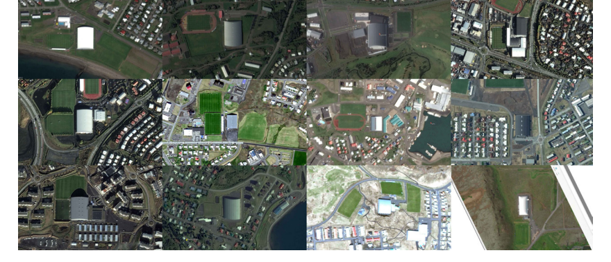
Composite image of all of Iceland's soccer houses via Google Earth.

[7] See Kolbjørn Rafoss and Jens Troelsen on the relationship between the Nordic "Sport for All" model: "Sports Facilities for All? The Financing, Distribution and Use of Sports Facilities in Scandinavian Countries," Sport in Society , vol. 13, no. 4 (May 1, 2010): 643–56, link.