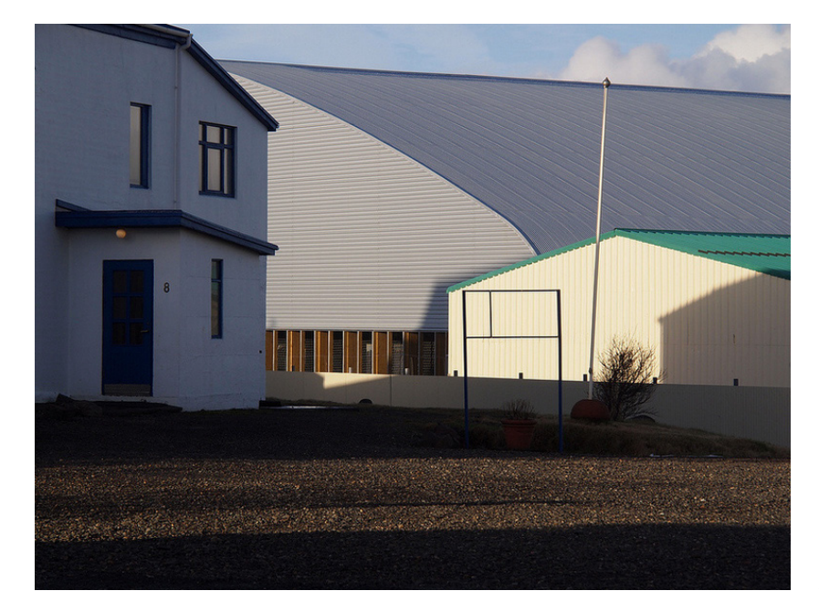
The Wave, Höfn, designed by Gláma/Kím Arkitektar, among industrial shacks, 2012. © Gláma/Kím Arkitektar.