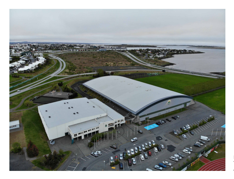
Fífan [The Cotton Grass], Kópavogur, designed by Teiknistofan Smiðjuvegi 11, 2002.

These accounts never mention that Iceland's more tangible economies, fishing and smelting, were never in danger, and, indeed, did well after the crisis precisely because of the fall of the króna, helping to stabilize the economy. The economy could therefore be rebuilt minimally reformed, let alone restructured. In a stunning manifestation of complacency and forgetfulness on behalf of the Icelanders, when Iceland played at the European Championship in France in 2016, its government was a coalition formed out of the same parties that had overseen both the privatization of the Icelandic banks in the first years of the millennium and the entrenchment of the ITQ system in the eighties and nineties, more on which below. [12]