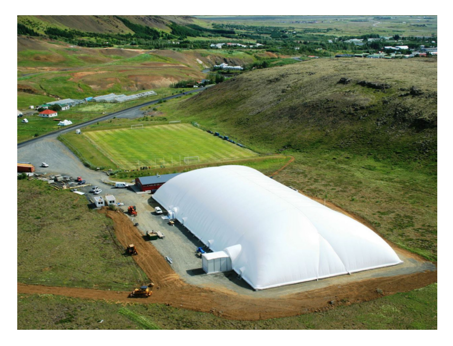
Hamarshöllin, inflated soccer house in Hveragerði, designed by Pro-Ark, 2012. Originally published in "Hamarshöllin," October 31, 2013, <u>link</u>.

[8] Some houses are even used by non-soccer players, such as golfers, joggers, and public-school gym classes.