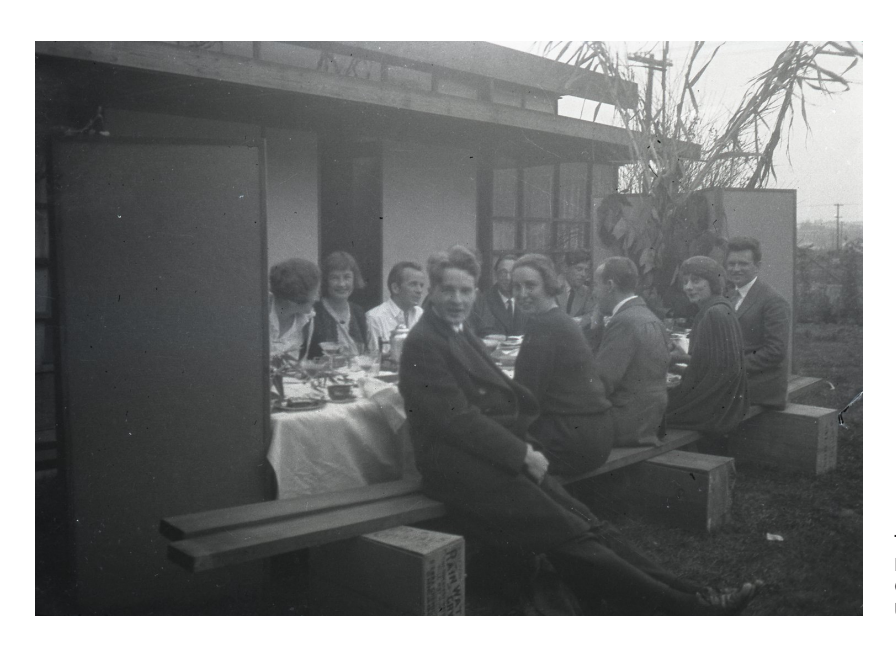
Thanksgiving at the Schindler House, 1924.

own. The house's pinwheel design was composed of four studios and a guest suite—each of the inhabitants, whether they were man or woman, husband or wife, would be granted the space to cultivate their own creative pursuits and enjoy the privileges of both solitude and community. There is an undeniable romance to the whole endeavor—something charming about the Schindlers' youthful idealism. They imagined the house to be a "cooperative dwelling," one that would choreograph social relations in concrete and wood, making material the desire to be at once within and outside of ourselves. [2] Flattening social hierarchies while embracing the natural world, the house dissolves the material and psychic boundaries between interior and exterior, public and private. From the bare concrete walls and exposed redwood beams to the sliding panel doors and built-in furniture, Schindler envisioned an architecture that would fade quietly into the background of the inhabitants' bohemian, collective lives.