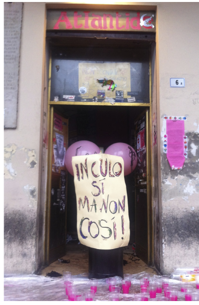
Left: "No Vat: More self-determination, less Vatican," making the Eccentric Archive in Bologna, Summer 2015. Right: "In the ass, yes, but not like this," the entrance to Atlantide the week of the eviction, October 2015.

toward transformation otherwise largely indistinguishable from the everyday life of transfeminist and queer self-invention and self-mythologization. The effort it takes to (re)narrate the contents of an intervention scrawled in a notebook during an assembly ten years prior, or to squint at a film negative only to see the inverted image of a lost comrade, or to remember in which year a flyer was written for an event that proved to be a turning point for a particular campaign, slowly begins to reveal a constellation of bodily and political affects, moods, and bottlenecks on the long road to becoming otherwise.