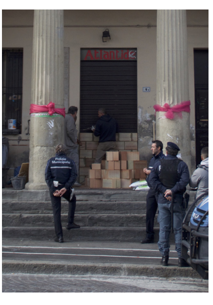
Left: "Self-management is the only solution/NO," the interior of Atlantide the week of the eviction, October 2015. Right: Bologna, City of Walls, the municipal police brick over the entrance to Atlantide hours after the eviction, October 2015.