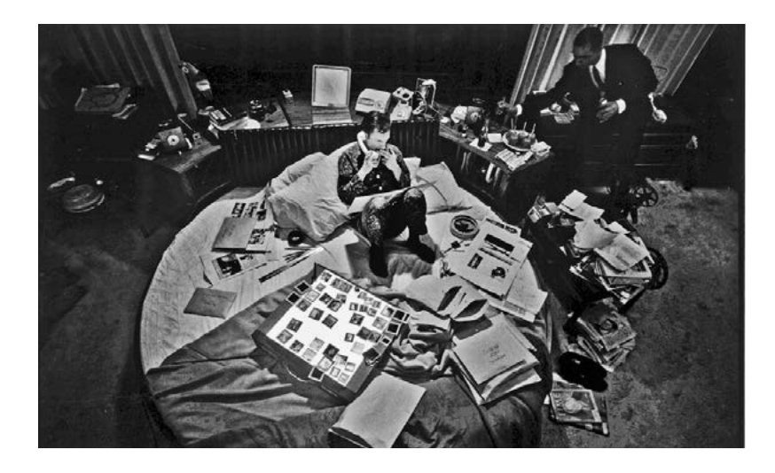
Hugh Hefner at the helm of his media empire: the bed.