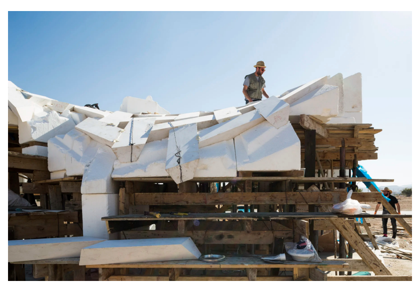
Construction on the vault of the el-Atlal artist residency project.

its history—a point nicely made in a <u>map assembled by Galletti</u> that shows the distribution of existing stereotomic vaults constructed between the twelfth and fifteenth centuries.