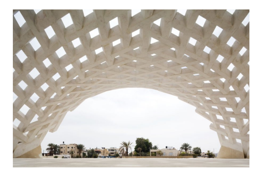
The first module and first built vault of the el-Atlal artist residency project in Jericho.