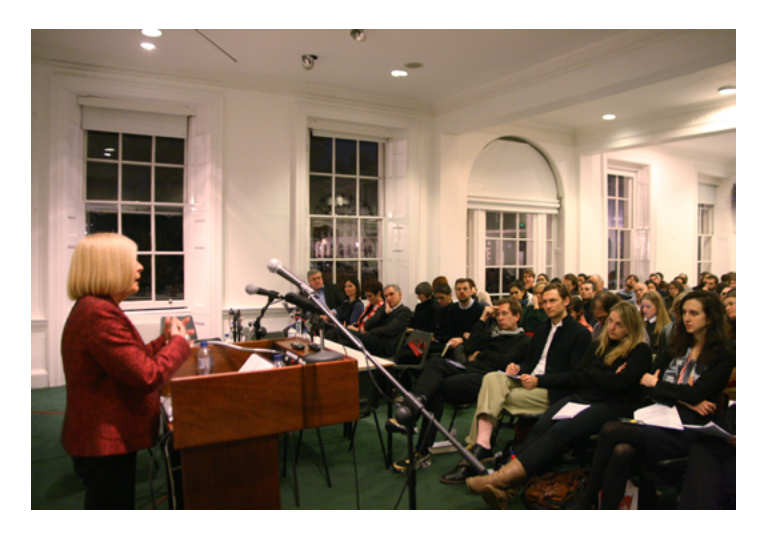
Chantal Mouffe delivers her response to presenters and the audience.

turn within which there remained a broad spectrum from critical to opportunistic. In gathering this group of leading theorists on the conjunction of architecture and politics, the Architecture Exchange event produced not only an assessment of Mouffe's relevance but also, and perhaps inadvertently, an assessment of the commonalities and limitations along this spectrum.