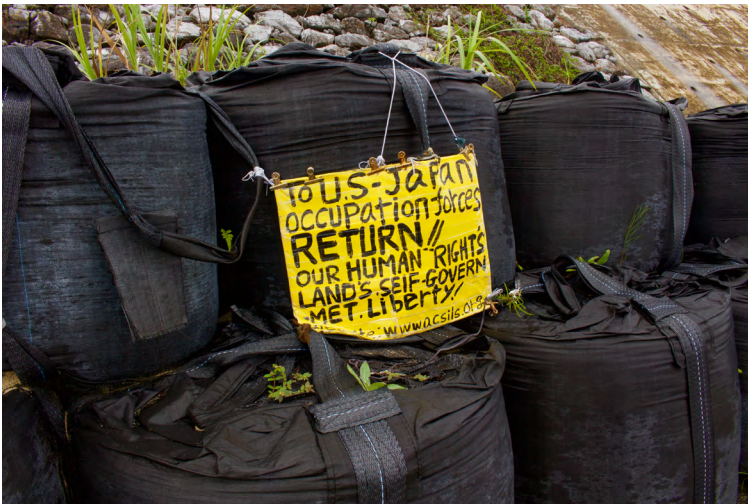
Taken at the protest site outside Camp Schwab, August 16, 2018.