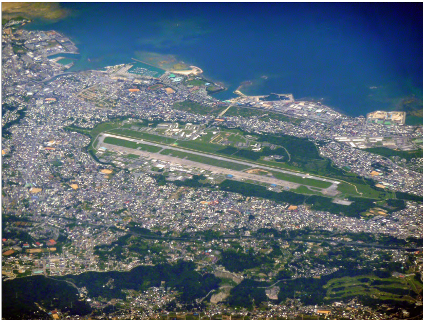
Aerial view of Marine Corps Air Station Futenma.