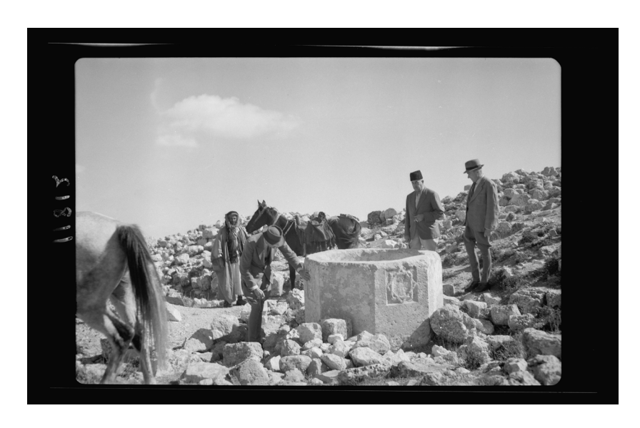
Baptismal font photographed on November 6, 1940, on the day of the opening ceremony of the Jaamari water source of Ain Hamda.