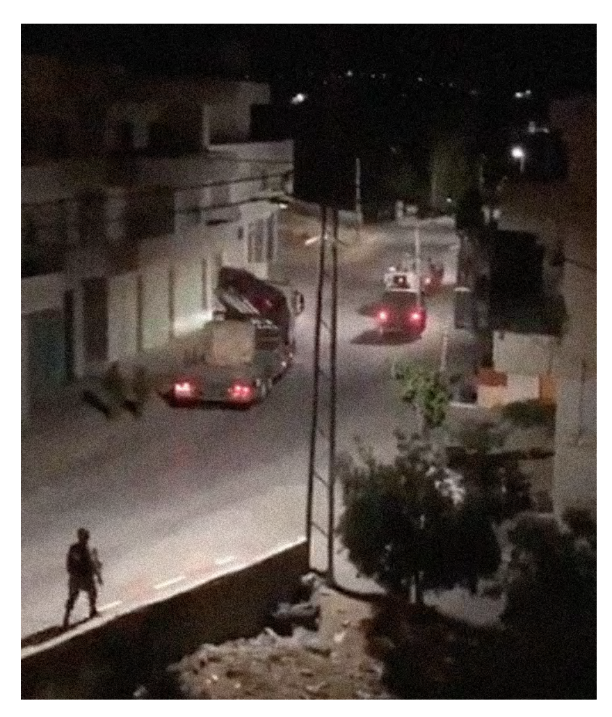
Israeli Defense Forces caught on cellphone footage looting a baptismal font from the village of Taquu. Screenshot from footage by Hussein Shejaeya, July 20, 2020.