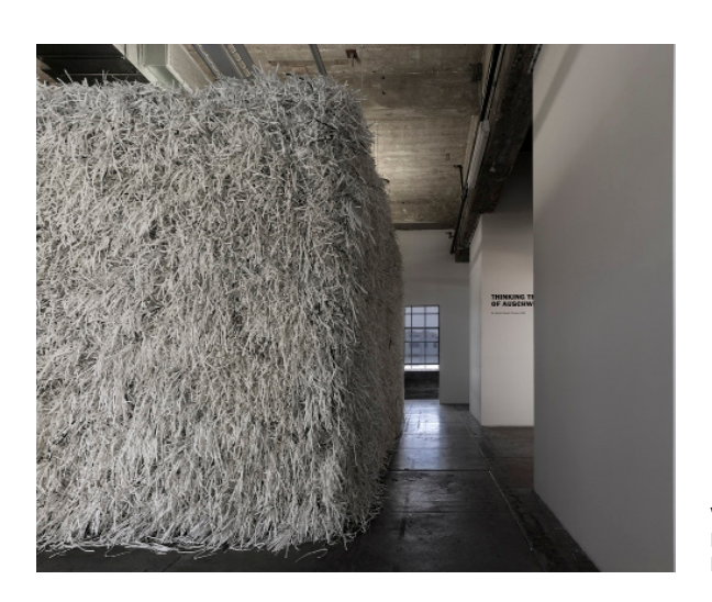
View of Thinking the Future of Auschwitz, SCI-Arc Library Gallery, 2014, Los Angeles.

Each regime is defined by its own temporal horizon, yet they are not opposed. Kahn and Thomsen's proposal allows for the commingling of tempo-