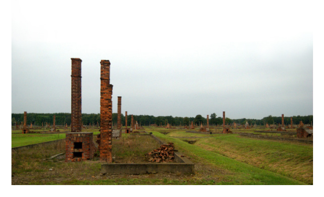
Auschwitz II-Birkenau, Owicim, Poland, 2013.

the physical state of the former camps. While the smaller and self-contained Auschwitz I has been preserved in the form of a museum (equipped with exhibition space, research, preservation, and curatorial staff), the much larger Birkenau (approximately 370 acres) is in an advanced state of ruin. The third condition, which challenges all site-specific acts of memorialization, has to do with the way in which one views Auschwitz as a locus of trauma. Trauma materialized in and through physical space is called upon to authenticate and thus validate one's claim to recognition of memory, meaning, and experience. Without authenticity, so the argument goes, there would be no way of legitimizing competing political claims to memory.