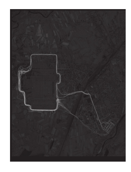
Tracing the paths of visitors around the perimeter of the Tel Olam.

For Kahn and Thomsen, memory and meaning are renewed by the arrival of an unknown and ever-changing destination.