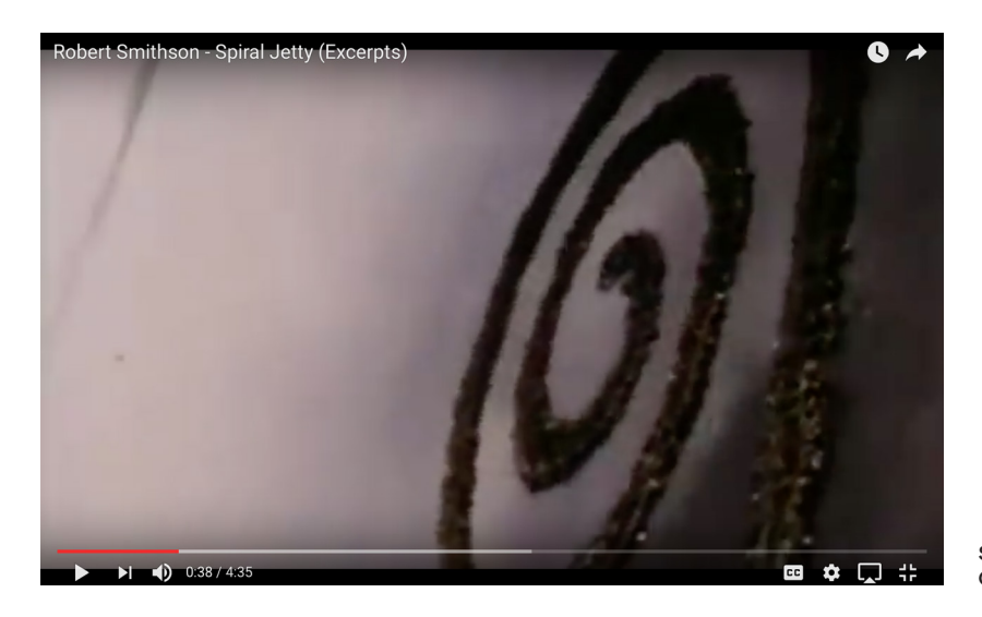
Still from Spiral Jetty . Exhibition "Traces du Sacré" at Centre Georges Pompidou, Paris. 2008.

evidence of marking the landscape; it exists as one aspect of a broadly conceived work.