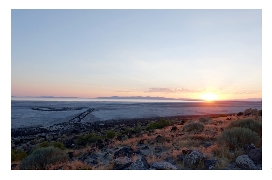
Spiral Jetty at sunset.

[1] Dia Art Foundation, "Robert Smithson, Spiral Jetty," link. Sadly, the spike itself has been squirreled away in an archive at Stanford University.